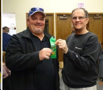
2nd Quarter Winner