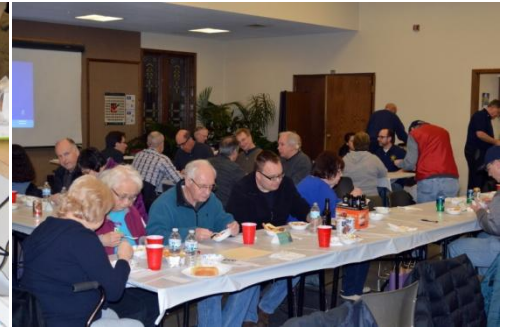
Sampling the Different Chili's - 2