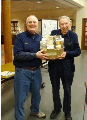
Last Yellow Ticket Winner