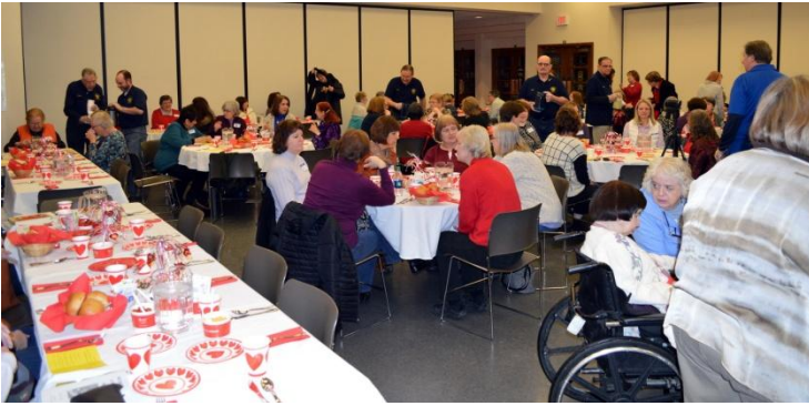
The Ladies starting off the evening