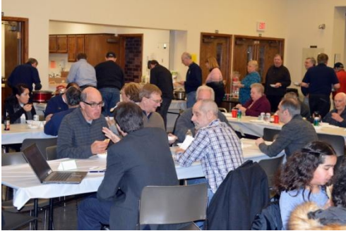
Sampling the Different Chili's