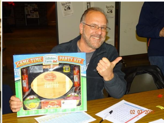
1st Yellow Ticket Winner