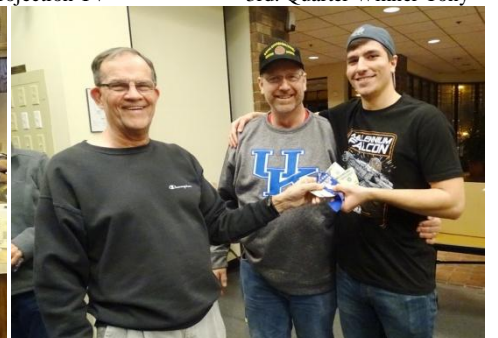
Final Square Winner