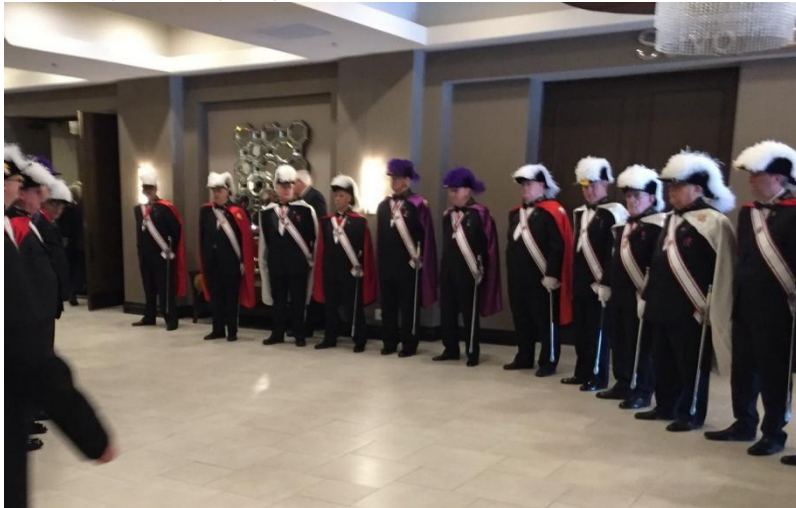
The Honor Guard awaiting the New Sir Knights from their Ceremony and getting ready to give them a sword salute