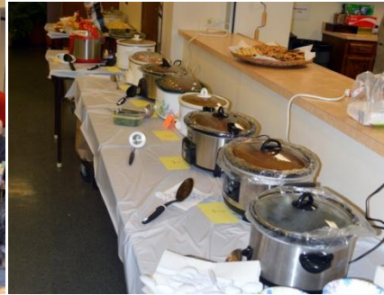
Record Number of Crock Pot Entries