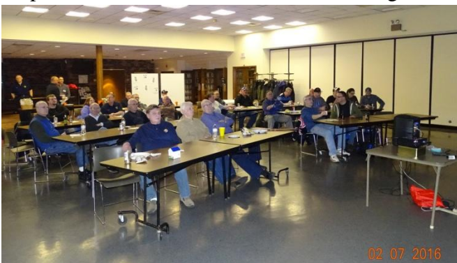
Brother knights watching the game intently