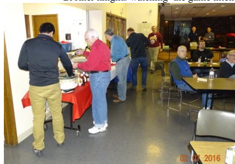
Getting some of the plentiful food