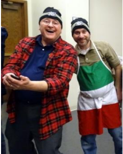
The Lucky "Hat" Winners