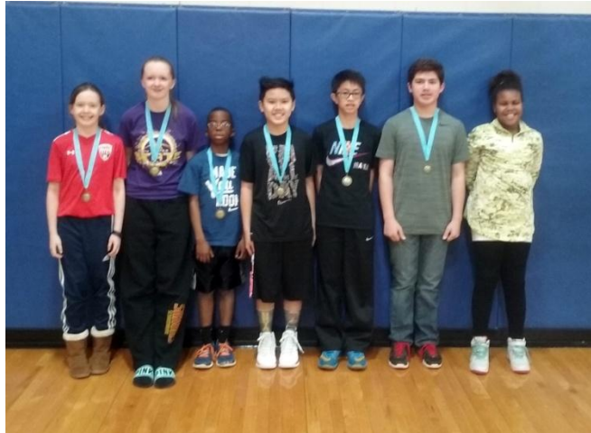
Pictured above are Medalists from our Council 6964