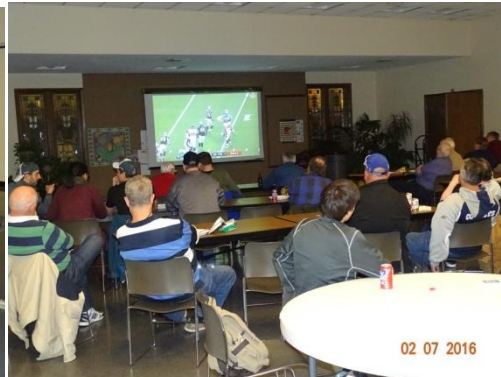
The Wide Screen Projection TV