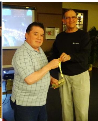
1st Quarter Winner