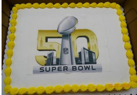
The Official Super Bowl Cake