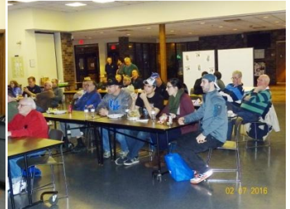
Watching the Game

Women at the Well: Church of the Holy Spirit hosted "Women at the Well" on February 9th. It was well catered by the Knights in our Council, 14 at last count. This will be the last of the "Women at the Well" events until after summer I believe. As usual, it was our pleasure helping out and serving the women.