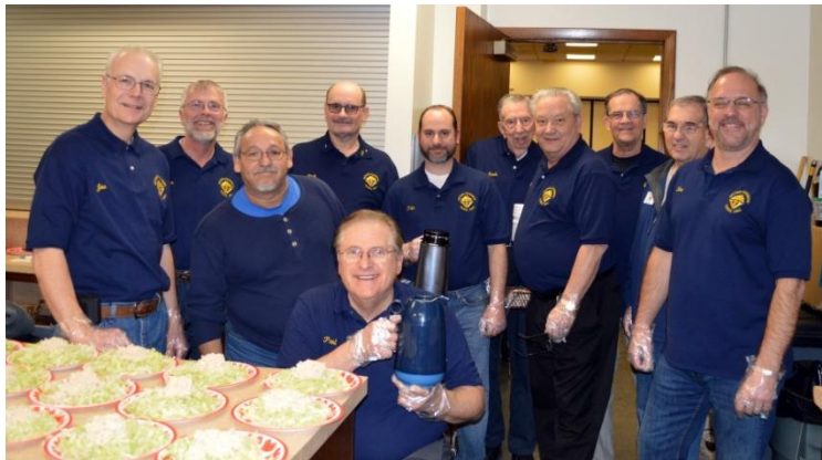
Group shot of the hired help

Women at the Well: Church of the Holy Spirit hosted "Women at the Well" on February 9th. It was well catered by the Knights in our Council, 14 at last count. This will be the last of the "Women at the Well" events until after summer I believe. As usual, it was our pleasure helping out and serving the women.