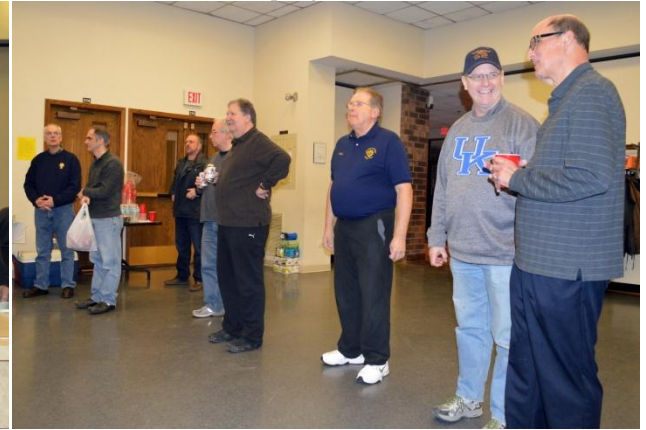
Had to Stand up after eating